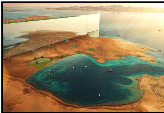
Artists rendering of The Line