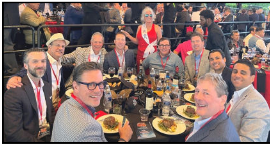
Dinner with friends for a great cause!

The 10th annual Cars & Cigars Charity Event was held at Freedom Hill on June 6th. This amazing event is sold out every year, raising money for the Celani Family Foundation & Hunger Free in the D. We had an amazing time and made some great connections!